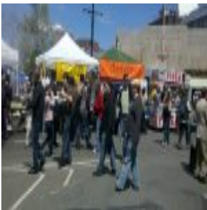
Cambridge Mayfair 5-05-13 1