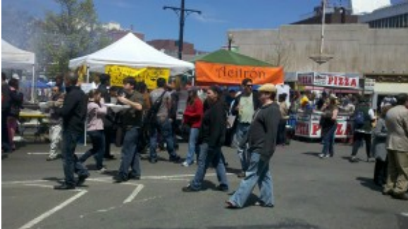
Cambridge Mayfair 5-05-13 1