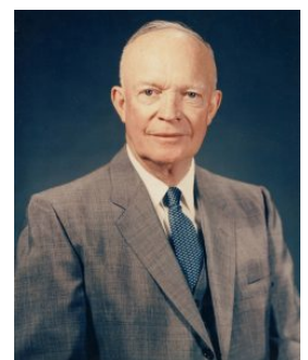
Dwight D. Eisenhower,

Forget about Clinton's emails, which would have been just as insecure on a government server as on her own, since anything on the network can be hacked, and just for the moment, put Benghazi aside as well. Of course, she lied.