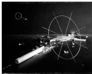
ABSTRACT IMPLSIONISM BY JOHN CHERVINSKY