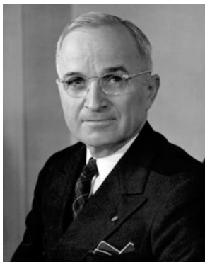
Harris S Truman http://www.trumanlibrary.org/photographs/view.php?id=2267 Credit: Frank Gatterer, United States Army

Roman emperors were nominally required to seek Senatorial approval for their decisions, but the Senate had long since become a rubber stamp. The U. S. Congress has a similar history of powerlessness in the face of certain kinds of presidential faits accomplis .