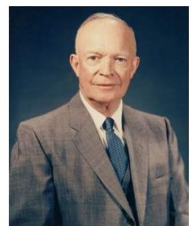
Dwight D. Eisenhower,

Forget about Clinton's emails, which would have been just as insecure on a government server as on her own, since anything on the network can be hacked, and just for the moment, put Benghazi aside as well. Of course, she lied.