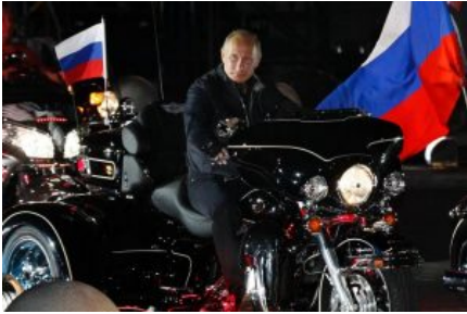
Putin on a bike

Motors executive might say now, "What's good for Trump is good for Trump. Forget the USA."