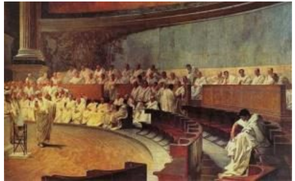
Roman Senate

begun to resemble that of the Roman emperor, Caligula, even more than that of Hitler.