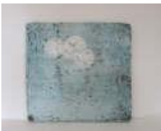
Anne Floche, Blue with White