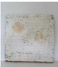
Anne Floche, Tablet with White