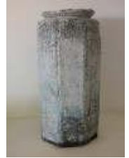
Hans Vangso, Tall Jar

the vessel surfaces as a result of these processes are unique in each vessel. Colors are subtle but there are unmistakable markings that appear to have gone through some form of geological stress.