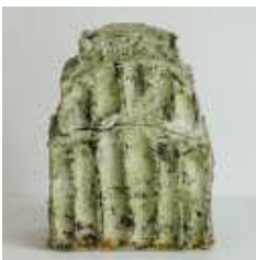
Anne Floche, Green Box

various forms and colors in clay by using utensils or implements to make markings on clay surfaces. The color principles of terra sigillata, a clay slip used like a glaze, informs her application of colors which are subtle yet rich in scale. For Anne, clay is a broad canvas whereas glazes, engobes and slips are paints for her artistic expressions. In this exhibition, she is inspired by architectures of different geographical locations. Her sculptures are composed to form landscapes or cityscapes of an imagined world.