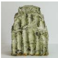
Anne Floche, Green Box

various forms and colors in clay by using utensils or implements to make markings on clay surfaces. The color principles of terra sigillata, a clay slip used like a glaze, informs her application of colors which are subtle yet rich in scale. For Anne, clay is a broad canvas whereas glazes, engobes and slips are paints for her artistic expressions. In this exhibition, she is inspired by architectures of different geographical locations. Her sculptures are composed to form landscapes or cityscapes of an imagined world.