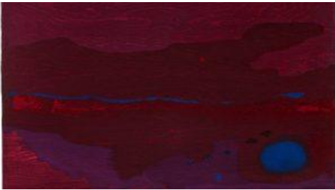
Japanese Maple, woodcut, 2005

“These efforts resulted in an entirely new, layered approach to color, which differed from traditional forms of woodcut in which images are pulled from a single carved block or from several different color blocks.”In the 1990s and early 2000s,