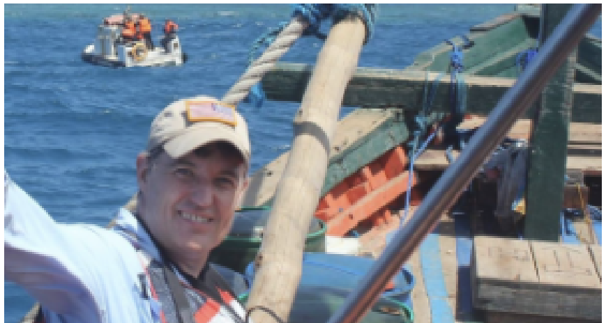
Anders Corr, PhD

Corr cites China's actions as ample reason for the US Navy to maintain its cautionary presence in the Pacific, which he regards as, "part of a global system of defense of not only the United States but its allies and values, which include international law, democracy, and human rights. To criticize the United States deployment in the Pacific as offensive without geographic context ignores the global picture and principles the United States is defending.