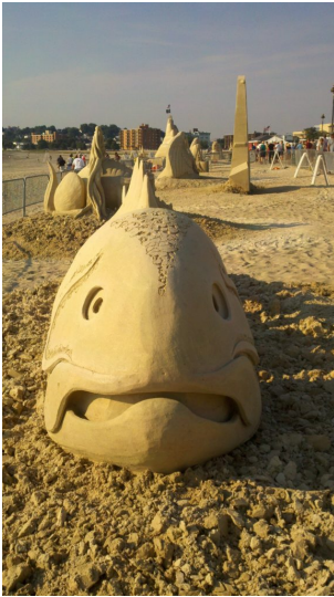
Skin & Bones #1 Revere Beach Sand Castle Competition 2012