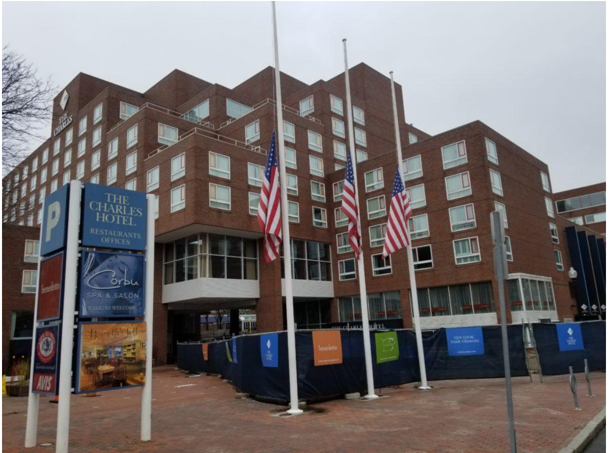
Flags at half mast.

But since the Phase I reopening last summer, I've gone there almost every day.