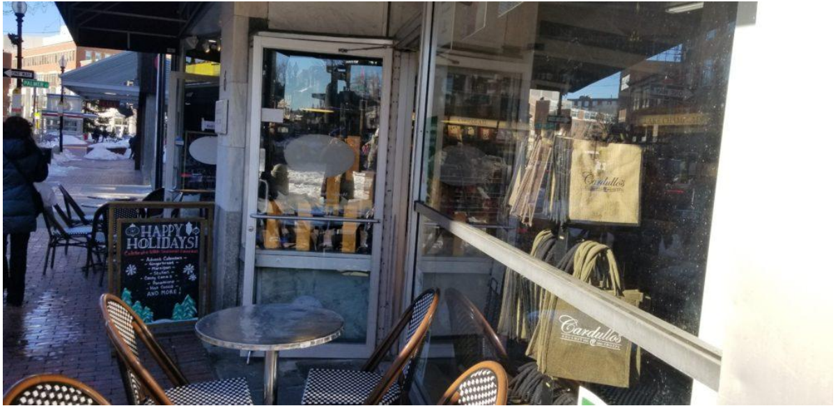
Cardullo's has survived