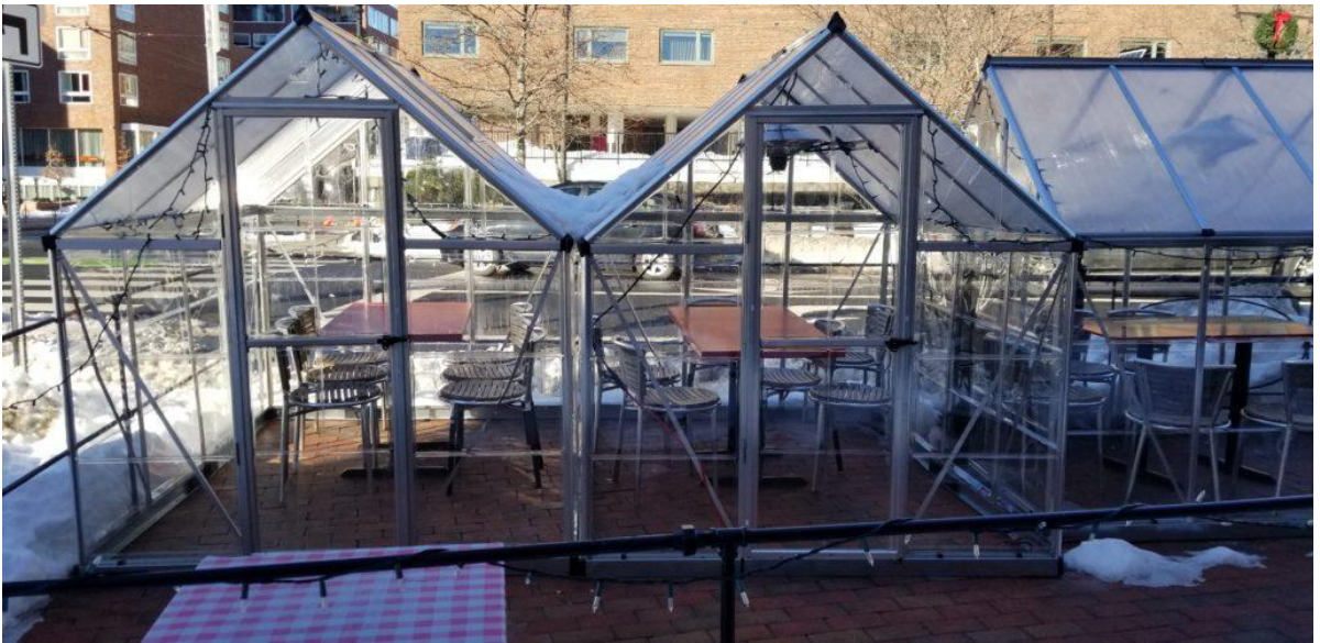
Outdoor Dining at Charlie's Kitchen