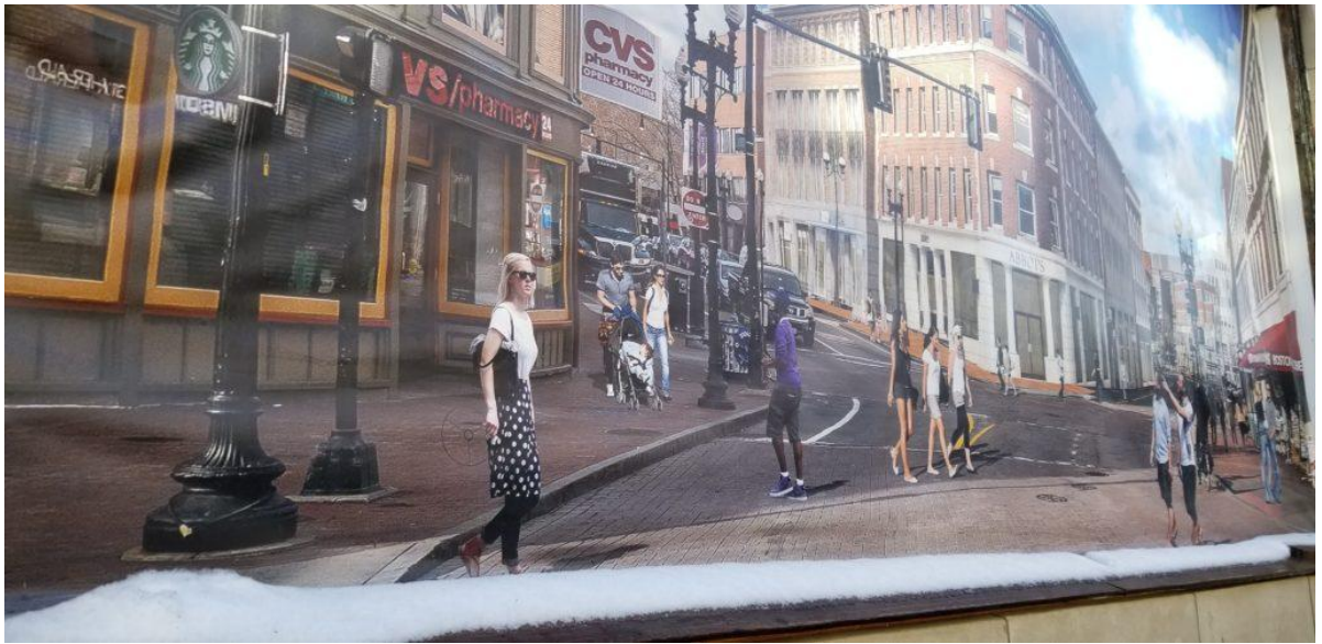
Photo mural of the Square in better days

Around another corner, while I shot photos of pictures of the old Square superimposed on what will be walls of the new , a construction foreman yelled out, "You're not allowed to do that!" I asked, "Why not?" He said, "Just kidding," and insisted on taking my photo, with my phone (Covid be damned!), alongside a construction truck.