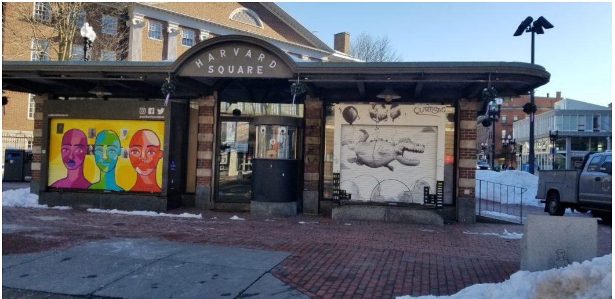
The former Out of Town Newsstand

Out of Town News has closed, and the newstand that once stood on the corner, opposite, is now a milk bar.