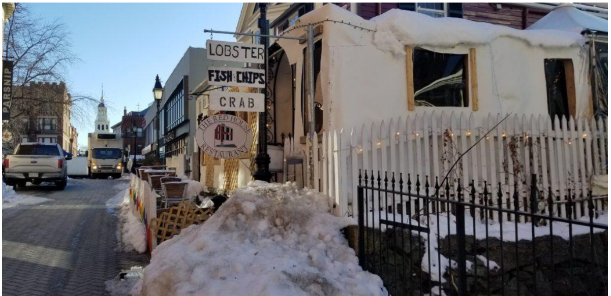
The Red House